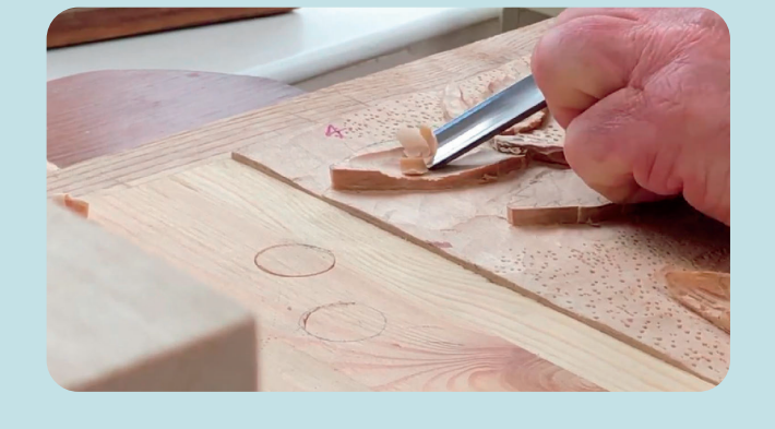
5. Adding Texture