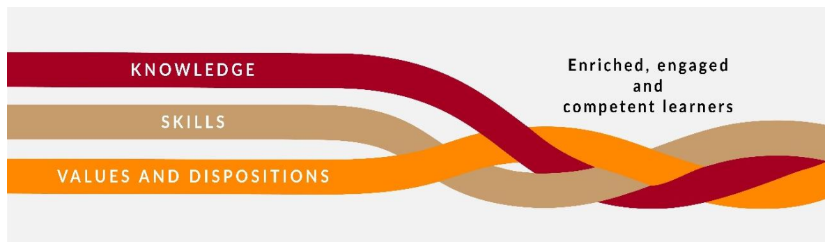
Figure 1 The components of competencies and their desired impact

Senior cycle helps students to become more engaged, enriched and competent, as they further develop their knowledge, skills, values and dispositions in an integrated way.